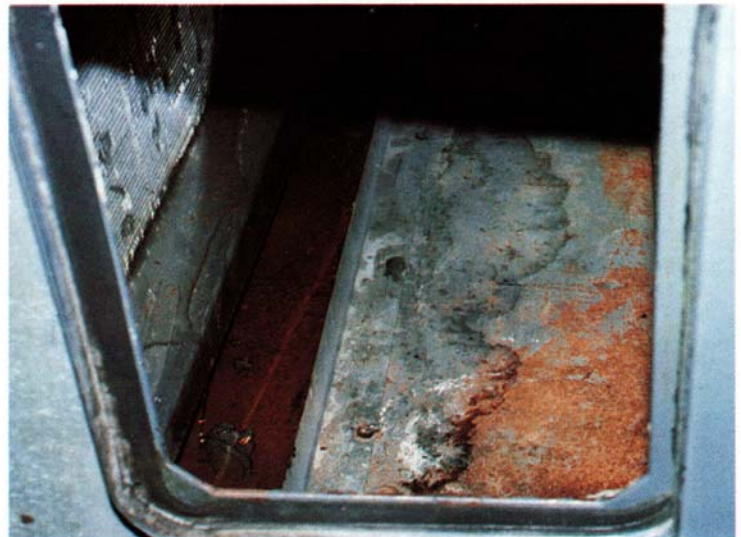
These photos illustrate conditions typical in many poorly-designed air conditioning units.