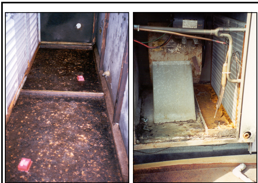
(a) Drain pan - large air handler (b) Drain pan - packaged hvac unit Figure 2 Common conditions of drain pans - rusty and contaminated

These hazardous conditions are readily observable by anyone interested enough to visit and inspect the air handlers in most any public, commercial or industrial facility. Examples of what to expect during such a visit are depicted in Figure 2. Generally, these air handlers will be of the draw-through type, operating without adequate drain seals—no traps or dysfunctional traps—on the condensate drain lines.