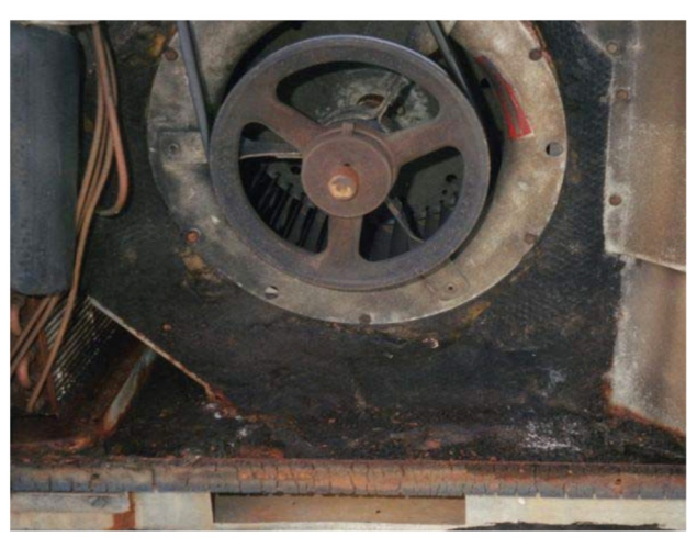
FIGURE 4: While this illustration only shows a flawed air handler, the impact on the health of building occupants can be fully appreciated only when it's realized that all air in a conditioned space passes through the contaminated air handler several times per hour.