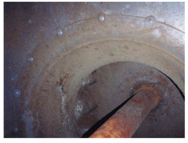
FIGURE 3: A damaged and contaminated air handler.