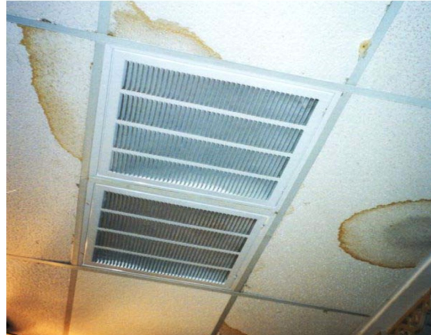
FIGURE 5: A damaged and contaminated ceiling.