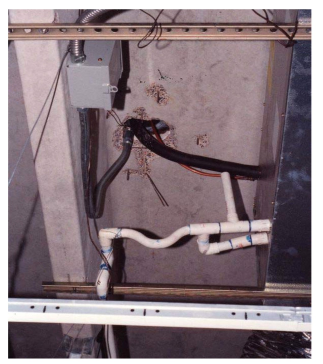
FIGURE 2: A typical industry-standard trapped system.

try, but the requirements are easily defined and are summarized.